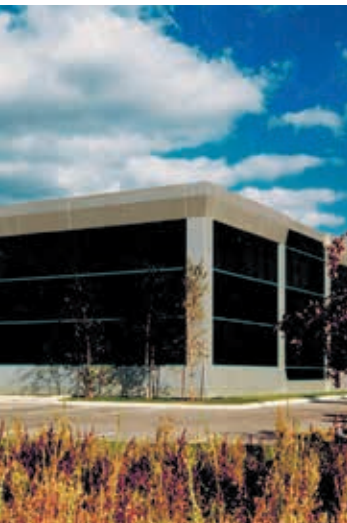
Left Retirement Community Centre Tillsonburg, ON