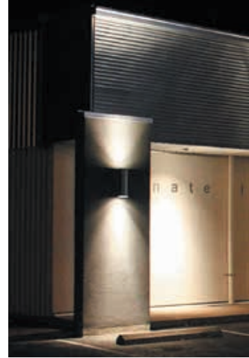
Above Commercial Building Tillsonburg, ON